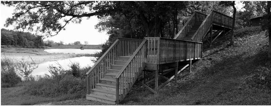
2006 Lakeview Lodge west stair well enclosed Lakeside Stairs dedicated November 18