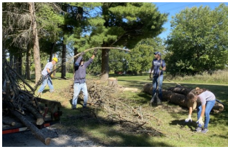
Spring & Fall Work Days