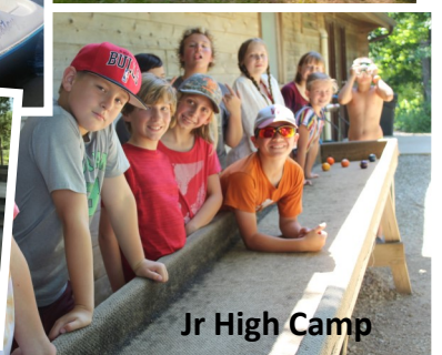
Jr High Camp