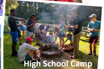
High School Camp