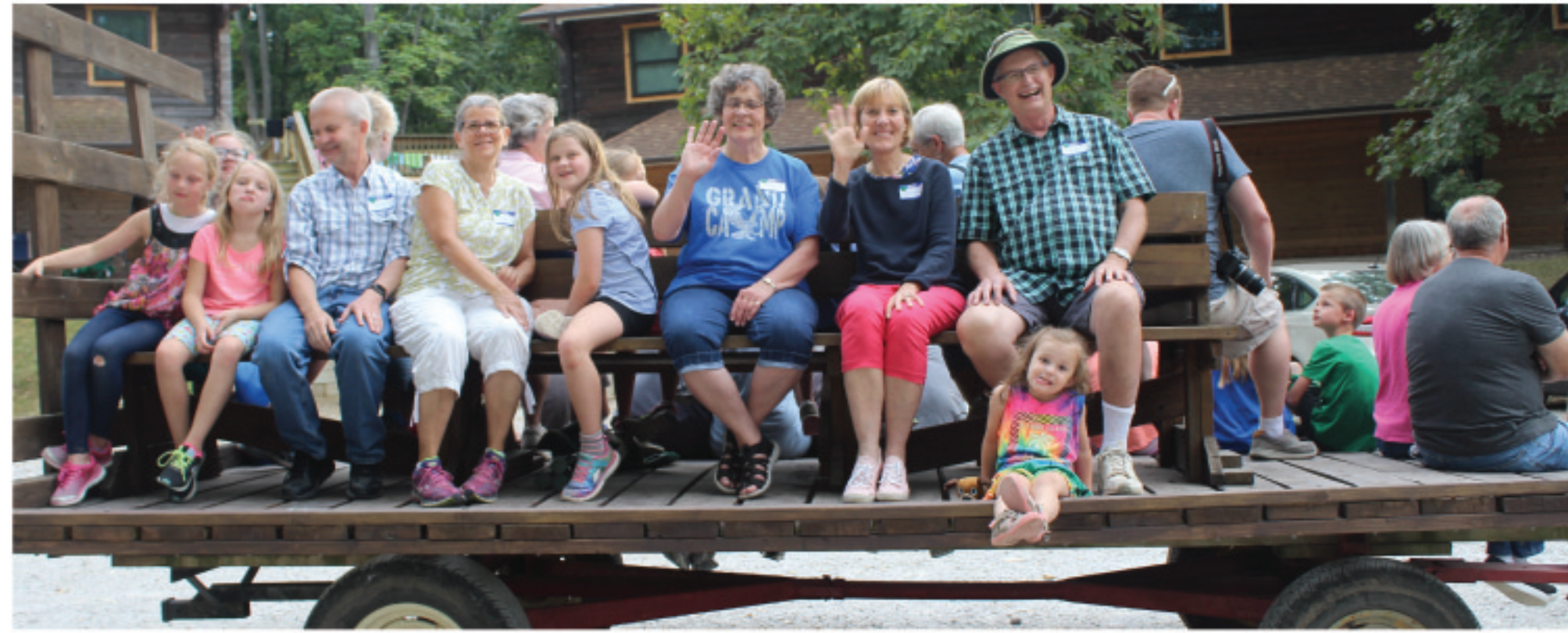
Grandparents & Grandkids - August 2-6

$300 per person, 11 & older; $250 per child 10 & under