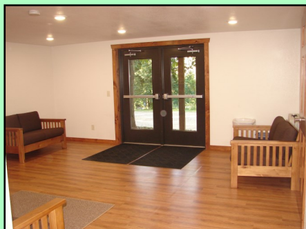
Commons room — angle 2