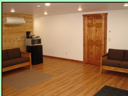
Commons room — angle 1