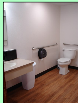
Shared handicapped bathroom