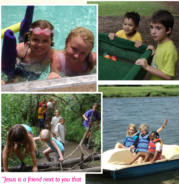
"Jesus is a friend next to you that will never let you down!"

If postmarked by March 1, 2014 you will also receive a $10/person discount.